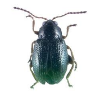
Epitrix (potato flea beetle):