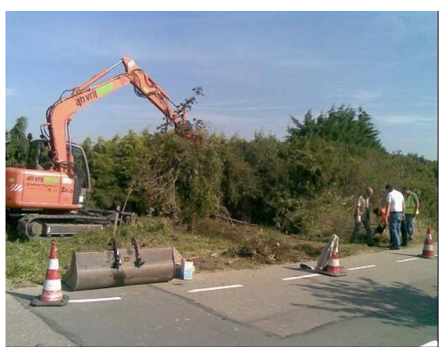
with EU co-financing